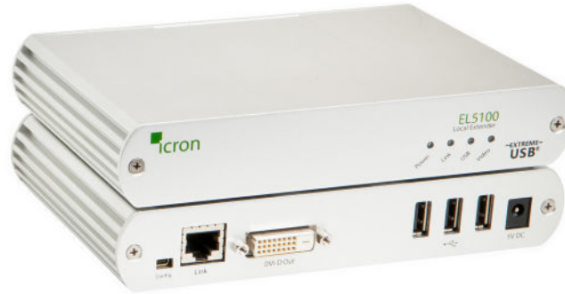
LEX (Local Extender)

The EL5100 extends both DVI and USB 2.0 up to 100m using a single Cat 5e* cable.