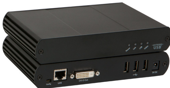
Local Extender front view

4664 Lougheed Hwy. Suite 221 Burnaby, BC, V5C 5T5, Canada icron.com +1 604 638 3920