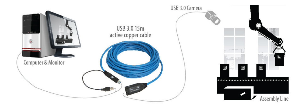
Figure 2 - Extending a Machine Vision Camera 15m with Icron's USB 3.0 Spectra<sup>™</sup> 3001-15 Active Cable

Additional considerations include operating temperature, FCC/CE electromagnetic compliancy (Class B is more stringent than Class A), locking connectors per AIA USB3 Vision specification, warranty term, bend radius and, if necessary, the ability to pull the cable through conduit. See Figure 2 below for a factory use case example with an active USB 3.0 cable.