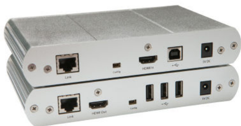
Rear view of LEX (top) and REX (bottom)