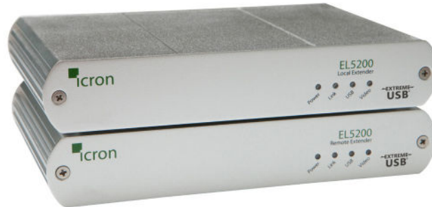
LEX (Local Extender)

The EL5200 extends both HDMI and USB 2.0 up to 100m using a single Cat 5e* cable.