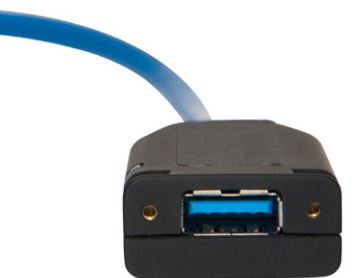
Locking USB Receptacle