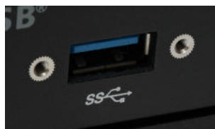
Locking USB Receptacle

* Up to 50m with USB 3.0 storage type devices and up to 100m or more is achievable when using USB 3.0 bulk traffic cameras.