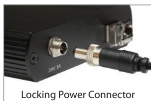
Locking Power Connector