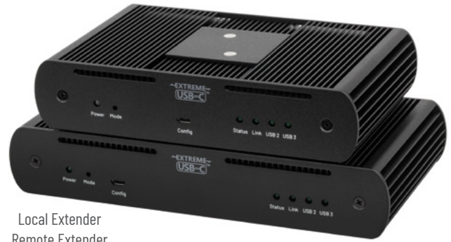
Local Extender Remote Extender

Extend USB cameras, sound bars, touchscreens, hubs, DACs and other USB-C or USB-A peripherals past the maximum length of a standard USB 3 cable (3m/9.8ft) to a PC or laptop across the conference room or to an IT closet with standard CAT 6a/7 cabling. Use the LAN pass-through port to deliver IP control to any connected USB devices.