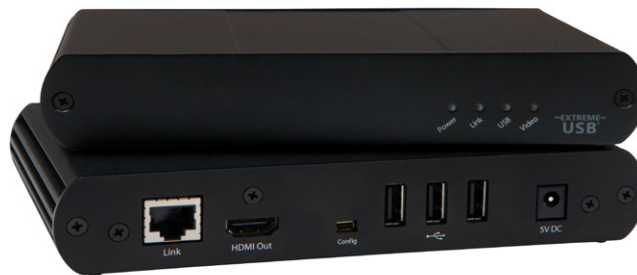
Local Extender front view

The VU5363 KVM Extender System features the latest and most robust HD video and USB extension technology from Icron Technologies. The VU5363 extends both HDMI and USB 2.0 up to 100m using a single Cat 5e/6/7 cable.