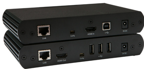
Rear view of local extender (top) and remote extender (bottom)