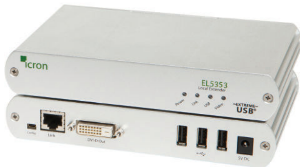
LEX (Local Extender) front view

The EL5353 KVM extender system features the latest and most robust HD video and USB extension technology from Icron. The EL5353 extends both DVI and USB 2.0 applications up to 100m over a single CAT 5e/6/7 cable.