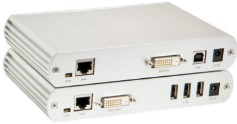
Rear views of LEX (top) and REX (bottom)