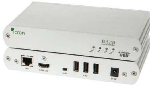
LEX (Local Extender) front view

The EL5363 KVM extender system features the latest and most robust HD video and USB extension technology from Icron. The EL5363 extends both HDMI and USB 2.0 up to 100m using a single CAT 5e/6/7 cable.