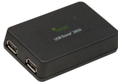
REX (Remote Extender)