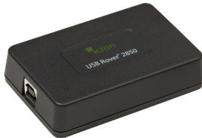
LEX (Local Extender)