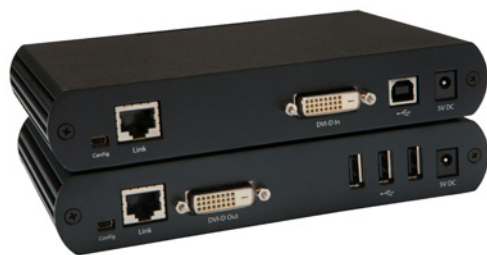
Rear view of local extender (top) and remote extender (bottom)