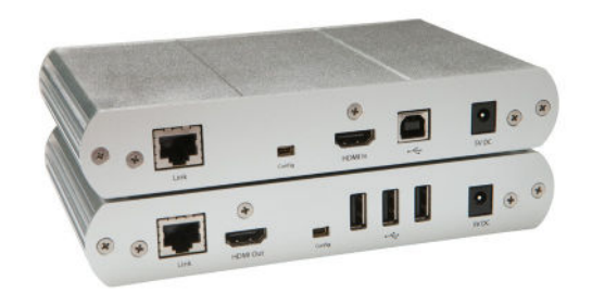
Rear view of LEX (top) and REX (bottom)