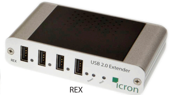
REX (Remote Extender)