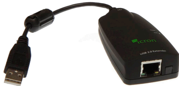
LEX (Local Extender)

The USB 2.0 Ranger 2104 extends USB 2.0 beyond the desktop up to 100m over standard Cat 5e* cable using ExtremeUSB ® technology.