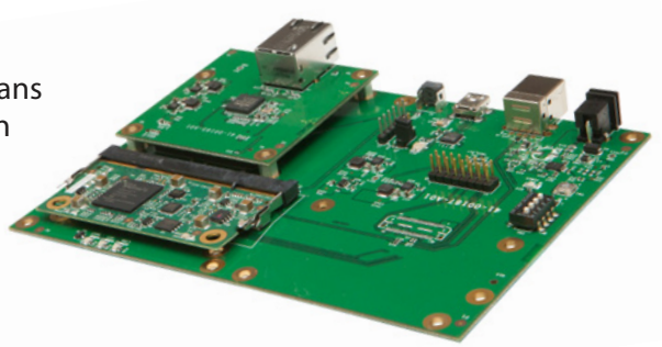
Local Extender Evaluation Board with GMII and Core Modules