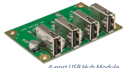
4-port USB Hub Module