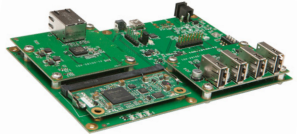
Remote Extender Evaluation Board with GMII, USB Hub and Core Modules