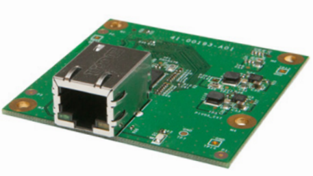
RGMII Link Interface Module