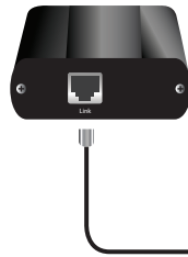
Local Extender (back view)