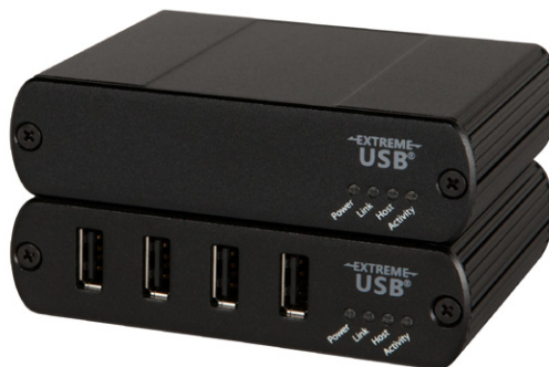
Local Extender Remote Extender

The USB 2.0 RG2324 with ExtremeUSB® technology extends high-speed USB 2.0 connections up to 500m using multimode fiber while the USB 2.0 RG2344 extends up to 10km over single mode fiber optics.